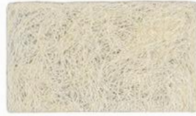
10 cm x 5.5 cm x 1mm ORDER: TC-FW-105501