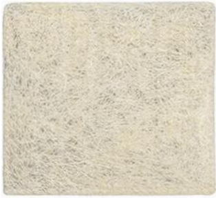
10 cm x 11 cm x 1mm ORDER: TC-FW-101101