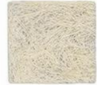
5 cm x 5.5 cm x 1mm ORDER: TC-FW-055501