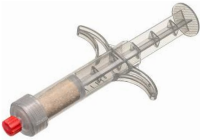
10 cc ORDER: TC-FFPS-10

Moldable Demineralized Bone Fiber with Mineralized Cortical Chips in Syringe for Easy Hydration, Mixing and Handling.