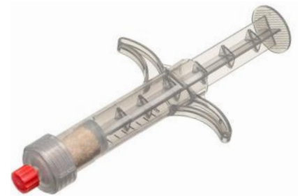
5 cc ORDER: TC-FFPS-05