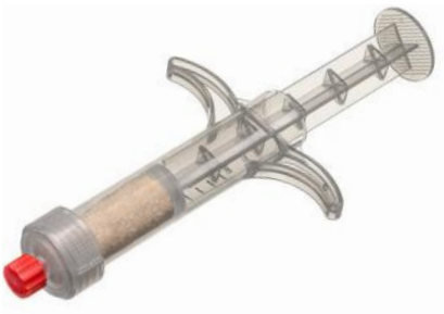
10 cc ORDER: TC-FFS-10

Moldable Demineralized Bone Fiber with Mineralized Cortical Chips in Syringe for Easy Hydration, Mixing and Handling.