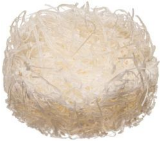
10 cc ORDER: TC-FFP-10

A moldable demineralized bone fiber form designed for use in orthopedic and spine surgery that also includes mineralized cortical chips.