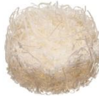
5 cc ORDER: TC-FFP-05