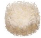
1 cc ORDER: TC-FFP-01