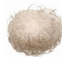
5 cc ORDER: TC-FF-05