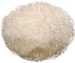
10 cc ORDER: TC-FF-10

Moldable Demineralized Bone Fiber Matrix.